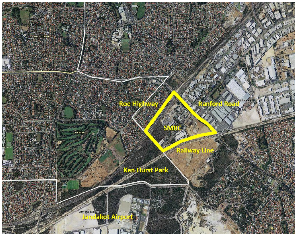
Recommended boundary adjustment for the parcel of land containing the SMRC's RRRRC for inclusion into the City of Melville

The attachment to this submission indicates the area of land specific to this submission shown (overlaid in red) on the LGAB Proposal 10 map, with the figure below showing the parcel of land (outlined yellow) in more detail.