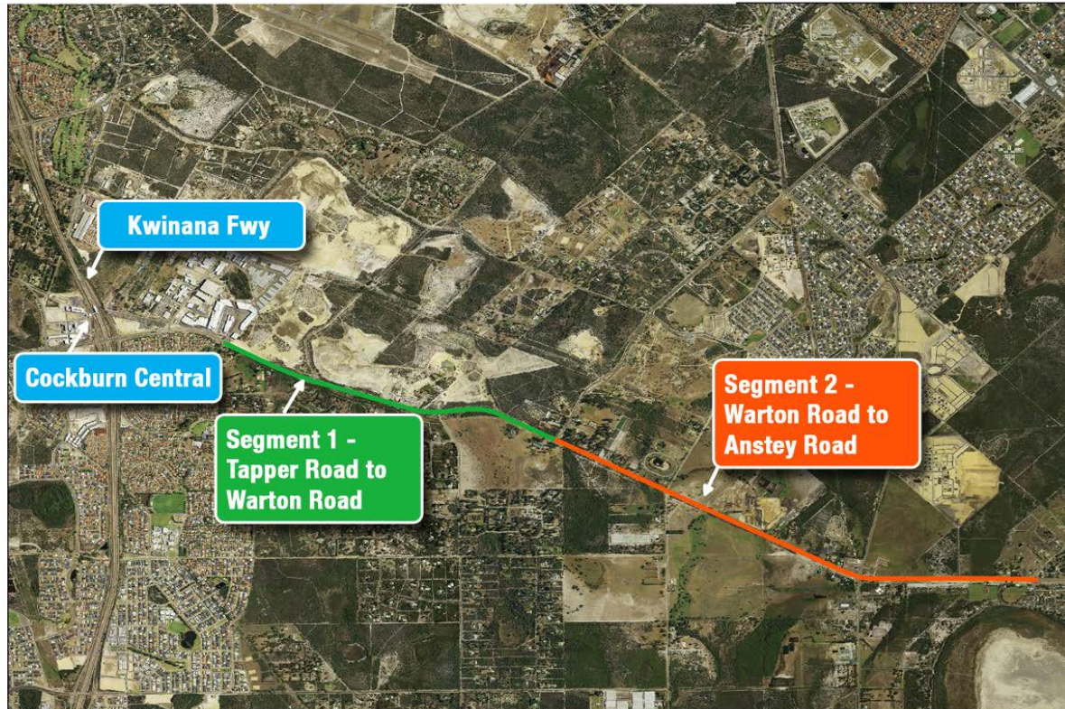
Dual Carriageway Armadale Road