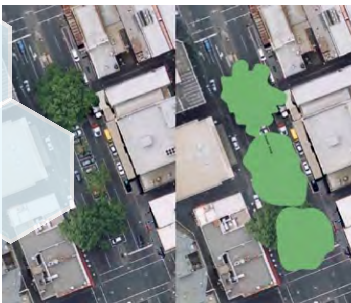
Below (Left) Example of ways the City of Melbourne is examining to increase canopy cover in the built environment from 27% to 40% by 2020