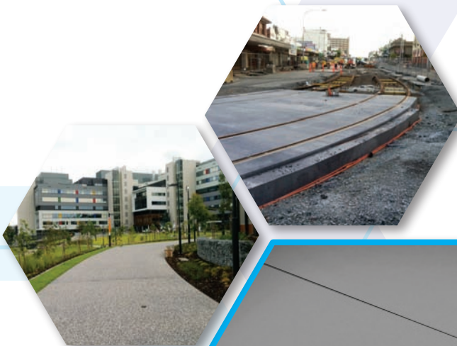
Middle Left: The Gold Coast University Hospital is positioned on a health and knowledge precinct with many characteristics common to the Murdoch Activity Centre.

The Gold Coast City Council provided a strong economic development focus associated with activation of city centres and tourism precincts, event facilitation and capturing value and legacies for the community in relation to major developments, infrastructure provision and events (health and knowledge precinct, Commonwealth Games, light rail, foreshore redevelopment).