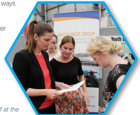
Federal Minister for Employment Participation, Hon. Kate Ellis talking with event support staff at the Youth Booth.