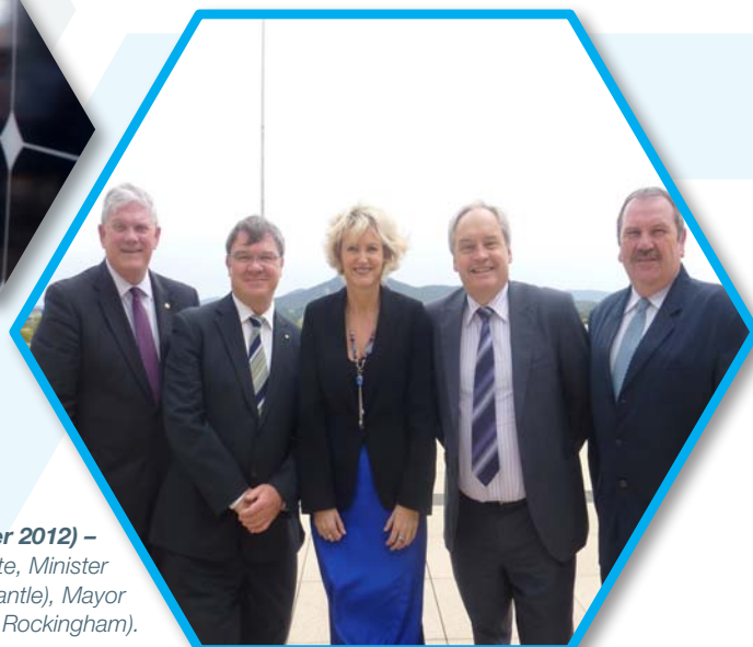
South West Group Mayoral Delegation to Canberra (October / November 2012) – Mayor Logan Howlett (City of Cockburn), Hon. Gary Gray (Special Minister of State, Minister for the Public Service and Integrity), Hon. Melissa Parke (Member for Fremantle), Mayor Russell Aubrey (City of Melville) and Mayor Barry Sammels (City of Rockingham).