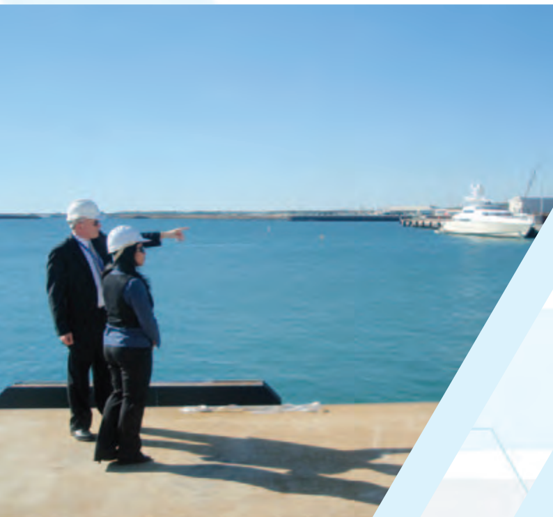
Left: Sabah Trade Facilitator, based in Malaysia, on a tour of the Australian Marine Complex (AMC) in Henderson, WA.

The South West Group hosted website www.sabahtrade.com.au continues to provide information for WA companies and the Sabah hosted website www.sabahwatrade.com receives over 3,000 hits per month and is a useful resource receiving international attention.