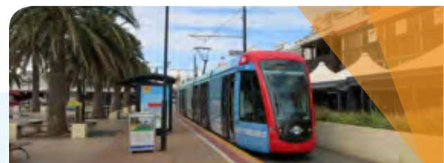
Image: Light rail connects activity centres between the Adelaide CBD and Glenelg in South Australia, attracting investment in higher density development along corridors and at nodes.

An alternative funding model for the introduction of light rail is needed, with greater private sector funding required to facilitate development investment and reduce contributions from State and Federal Governments.